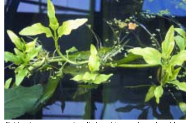
Eichinodorus, commonly called marble sword, sends out long stems that produce plantlets. When the plantlets have acquired roots, you can snip them off for repotting.

Unlike Koi, plants have more than one way to produce offspring. In fact, it is common for aquatics to use multiple reproduction techniques. Certain tropical water lilies, Nymphaea var., are excellent examples. They produce seeds from the flower, offshoots from the tuberlike root, and new little plants from the leaves.