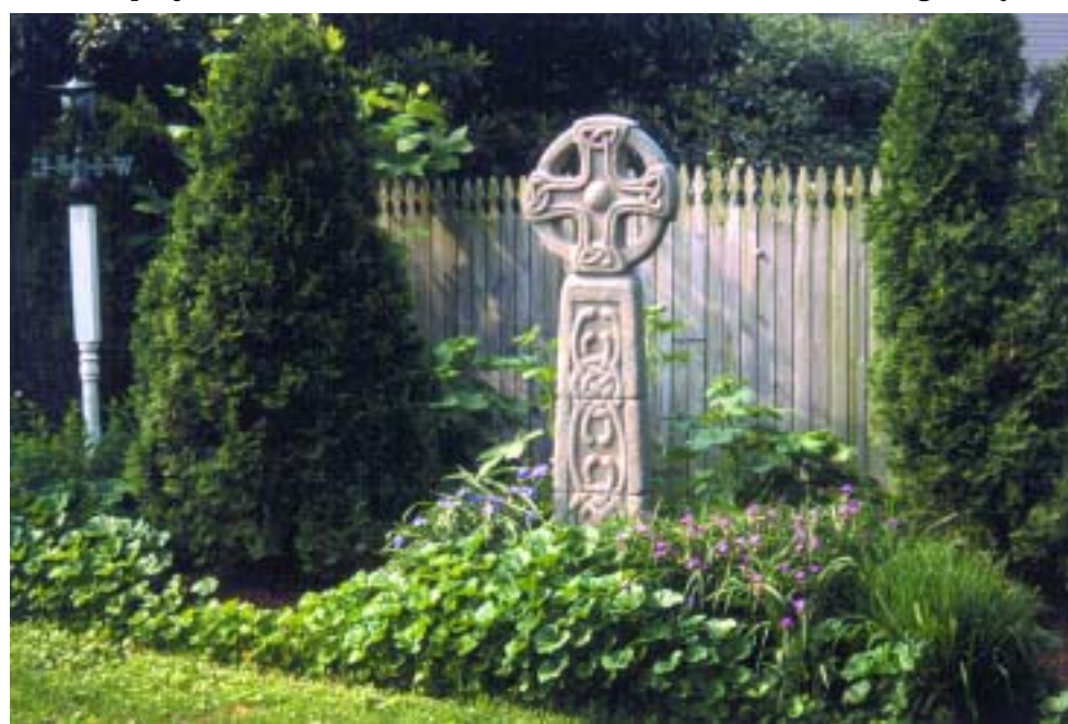
A special "find," the Oylers' celtic cross is set within a perimeter bed and highlighted at night with a garden spotlight.

Our backyard had three very old and halfdead sweet gum trees. That was it. We stared at the back of the neighbor's garage as the back fence had fallen down. The first thing Wally did,