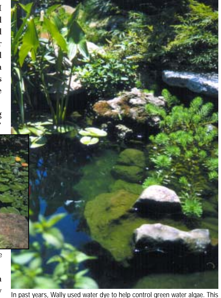
In past years, Wally used water dye to help control green water algae. This year, however, he reports the use of Microblift bacteria has done the job.

Today our yard is about as full as it can get without cutting into the space reserved for our