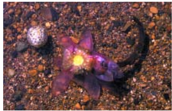
Some water lilies will produce an elusive seed pod. We say 'elusive' because the pod quickly breaks down and disperses its seed, often without the pond owner ever knowing it happened.

Offshoots from tubers & rhizomes - Water lilies and some marginals can be propagated by cutting or breaking off the new eyes or side shoots that develop on the parent rootstock. It occurs with both the tubers of tropical lilies and the rhizomes of hardy lilies or marginals. The little buds are then potted and will develop into a full sized plant, usually within the growing season.