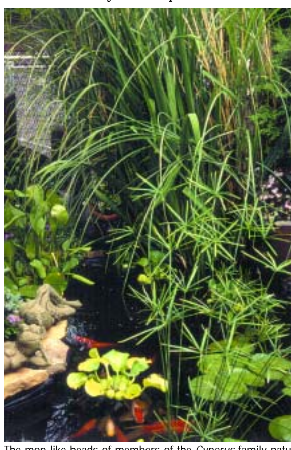
The mop-like heads of members of the Cyperus family naturally lean over to touch the water. This allows new plantlets to generate from the submersed flower heads.

Seed - This is the easiest way to get LOTS of plants from waterlilies, lotus, and marginals. However, it takes the longest to produce full-sized plants. (A 2000-year-old lotus seed found in Egypt actually sprouted and grew.) Not all lilies will produce seeds and even if they do, sometimes the seedlings are not exactly like the parents.