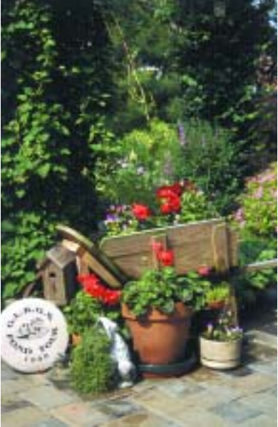
A special vignette created on their patio includes the stone commemorating their garden's inclusion in the annual pond tour hosted by the Greater Louisville Koi and Goldfish Society.

a lot of love – a love of nature and love reflected in the special memories of our life together.