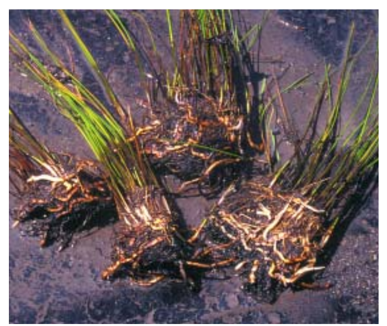
Upright-growing marginal plants, such as Scirpus , are most easily propagated by root division. Simply cut the rinsed root ball into sections and repot them.

Since they reproduce so prolifically, they could be called Nymphaeamaniacs .