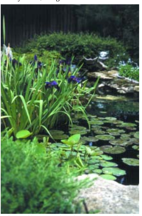
Wally's pond is 8 x 11' and 30" deep. A 12 x 2' creek recycles the pond's water over a 2' high waterfall with a 1650 GPH pump. He made his own in-pond filter. His gargoyle, Dido, watches over the pond.

So you see, our garden was built out of love