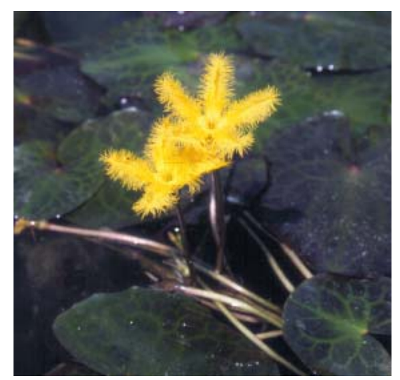
Members of the Nymphoides family, such as this 'yellow fringe,' send out many runners from which develop plantlets of invasive proportion.

Some procedures to follow when propagating aquatics will make the job quicker and less stressful, for both you and the plant. Most importantly, work in