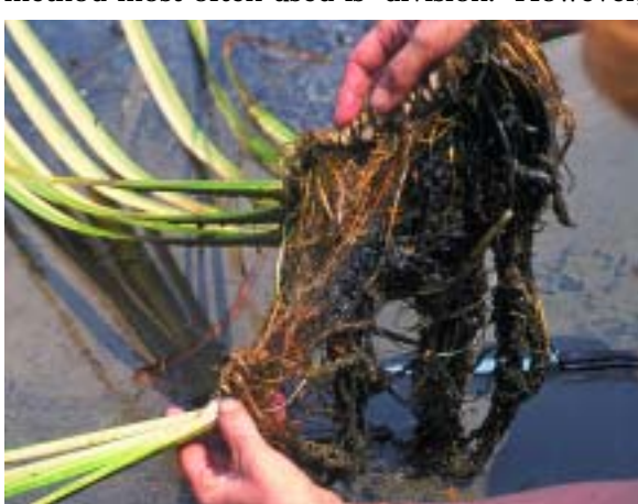
New plantlets of sweet flag, Acorus calamus , are formed along a surface-running rhizome. Rooted sections can be cut away and repotted. Keeping the running rhizome submerged in water encourages necessary root production for propagation.

For hobbyists, the aquatic plant propagation method most often used is 'division.' However,