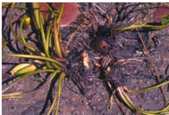
Hardy water lily rhizomes produce eyes that develop into individual plants, if cut from the mother rhizome and repotted. Be sure the eye has some root growth to ensure its survival.