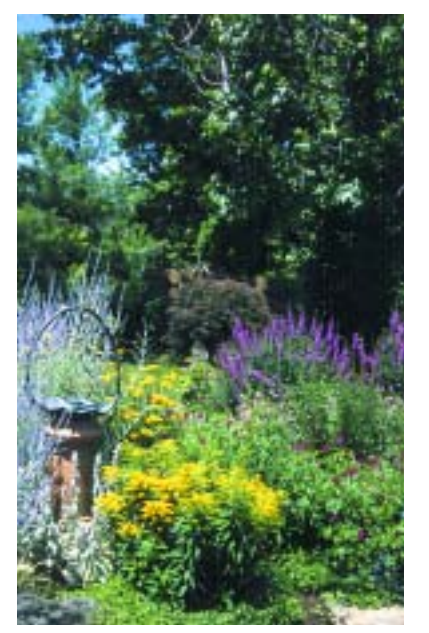
Wally's famous last words: "No flowers."

three Labradors. Wally's initial plan of 'no maintenance' hasn't exactly been the outcome. Instead, our yard is a reflection of our life. No special plan, just