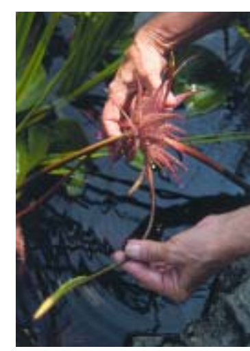
The easiest way to propagate lotus is by root runner division. Ordinarily occurring within soil, this runner escaped its pot and displays its manner of growth.

the shade whenever possible, especially when dividing or repotting water lilies. Lily pads wilt and die very quickly when out of the water. When dividing a potted plant, such as a clump of iris, take it out of the pot and then hose all the soil off the root ball. Even though soil is lost, it