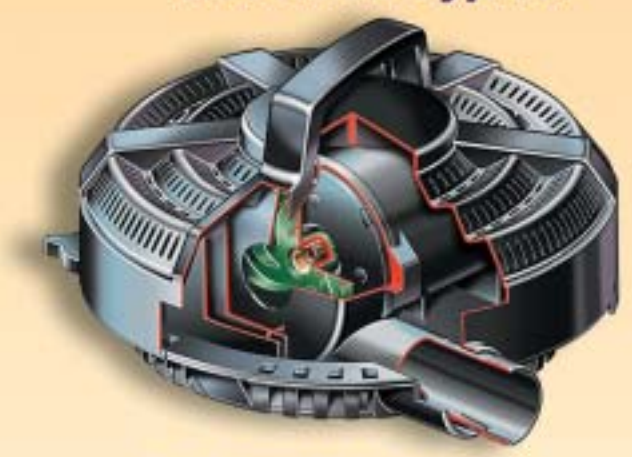
THE TITAN PUMP AVAILABLE IN FOUR SIZES FROM 550 GPH TO 2100 GPH

Experience the peace and serenity of your own Perfect Pond from Hozelock Cyprio!